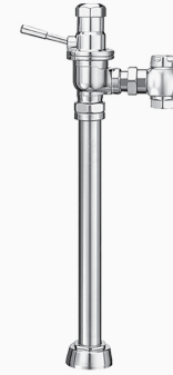
Variation Not Shown: 1.5" Offset